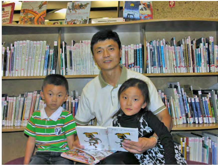
1. This is Jerry and his children, Hannah and Tom. Yesterday, he took them to the Millennium Library.