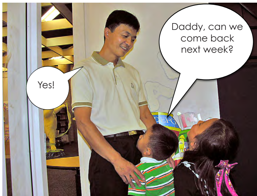
Tom is asking his dad a question.