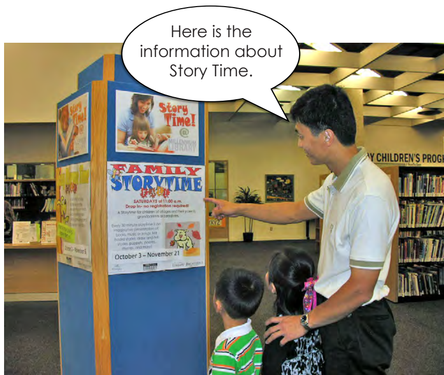
This is the children's first story time.