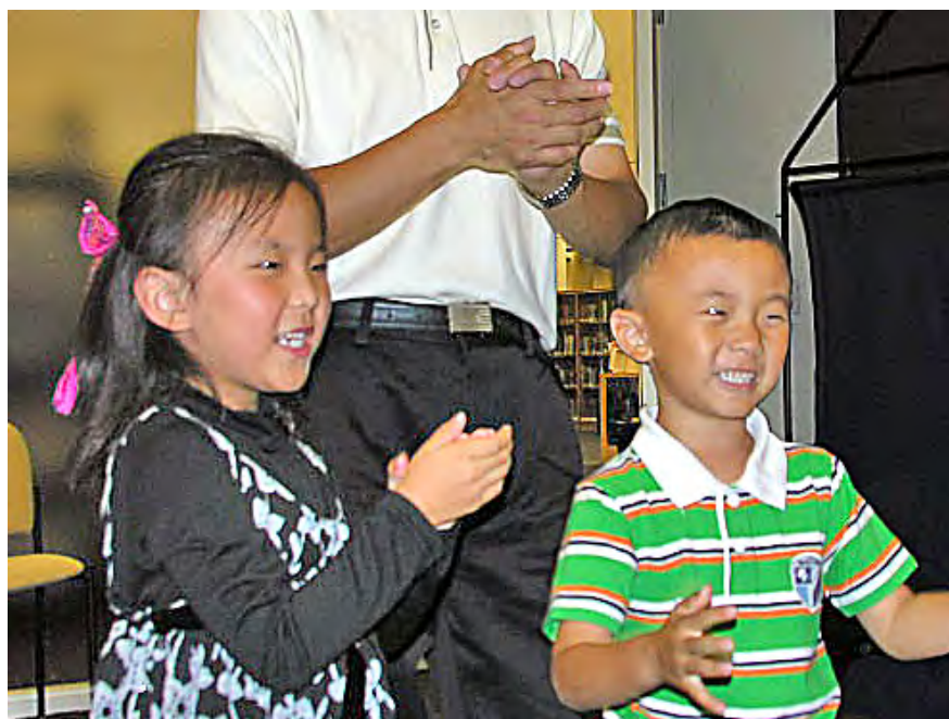
Everyone sings a song when the story is finished.